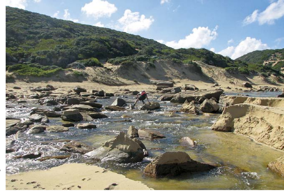
Crossing Wilyabrup Brook during medium flow. Carefully wading across further upstream would be easier and safer